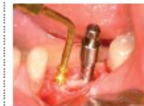
implant site preparation