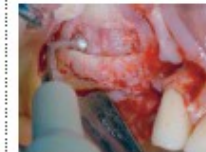
sinus lift technique

PIEZOSURGERY® – the only evidence based piezoelectric bone surgery!