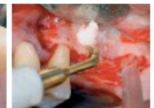
bone chip harvesting