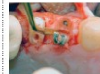
sinus lift technique